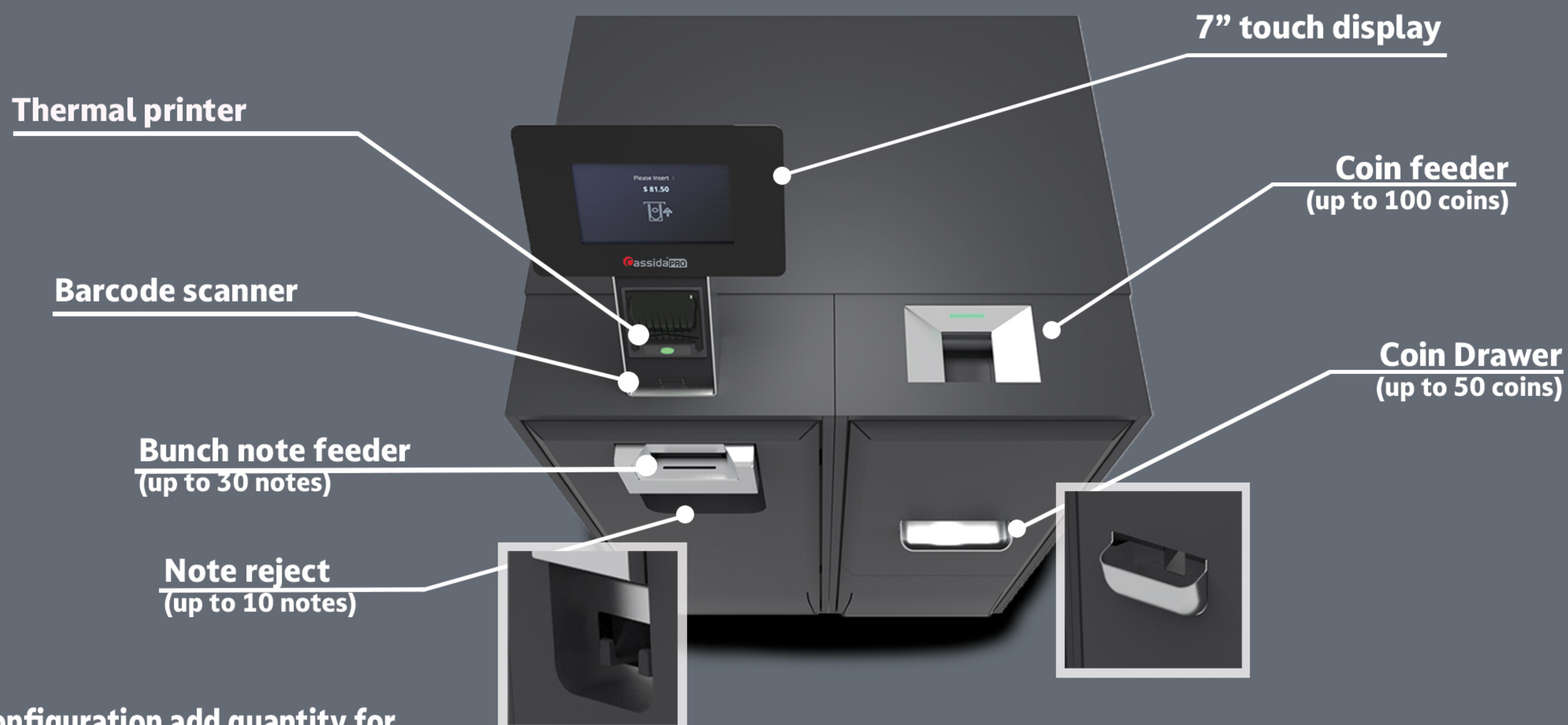
Coin configuration add quantity for USD Hopper #Denomination Quantity